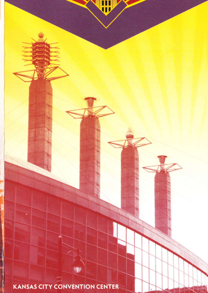
KANSAS CITY CONVENTION CENTER

KANSAS CITY, MISSOURI AUGUST 17-21, 2016