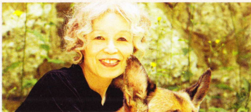
Kinuko Y. Craft